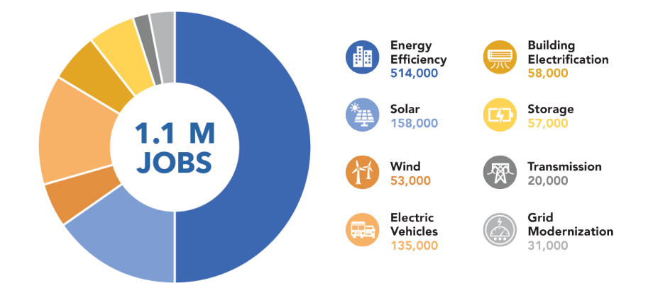
Figure 2. Impact of $25 Billion Stimulus Investment on Colorado Employment (job-years), by Technology