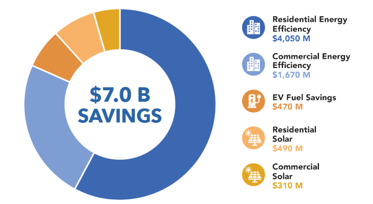
Figure 3. Impact of $25 Billion Stimulus Investment on Colorado Consumer Savings (annual), by Technology